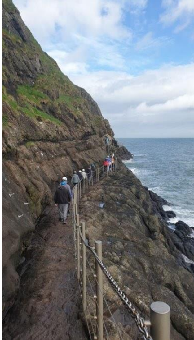
16 - Gobbins Cliff Walk