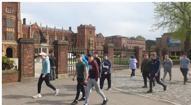
13 - Students on a tour of Belfast City