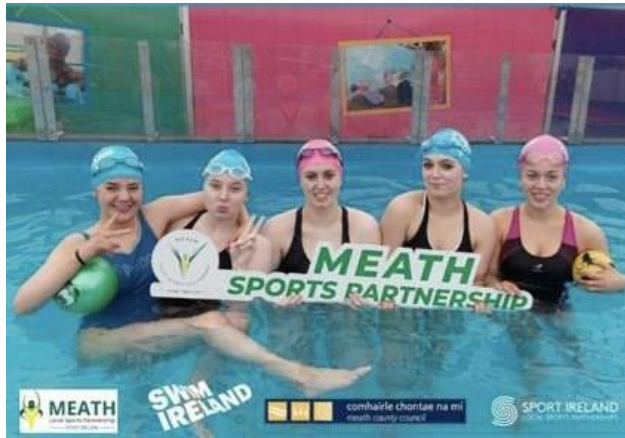
21 - TY Students Feature on the RTE Today Show.