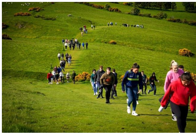
20 - 6th Year Trip to Lough Crew