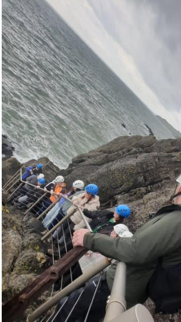
12 - Gobbins Cliff Walk