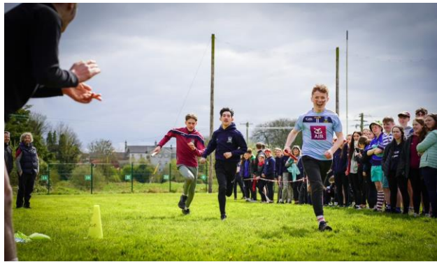
32 - Sports Day 2023

St Oliver Post Primary Educating, Empowering, Caring