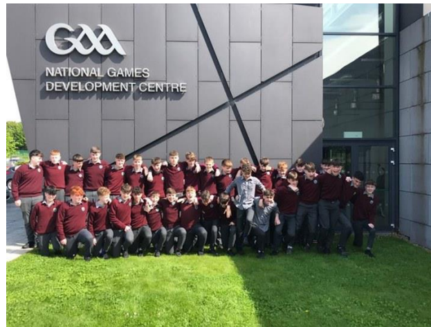
9 - 2nd Years Boys in Abbotstown GAA

The 2nd year boys' team had also progressed to the final stages of their competition. After a long wait the Leinster final was played in Abbotstown on the 17th of May. In a very close contest we lost out by the finest of margins to CBS Kilkenny.