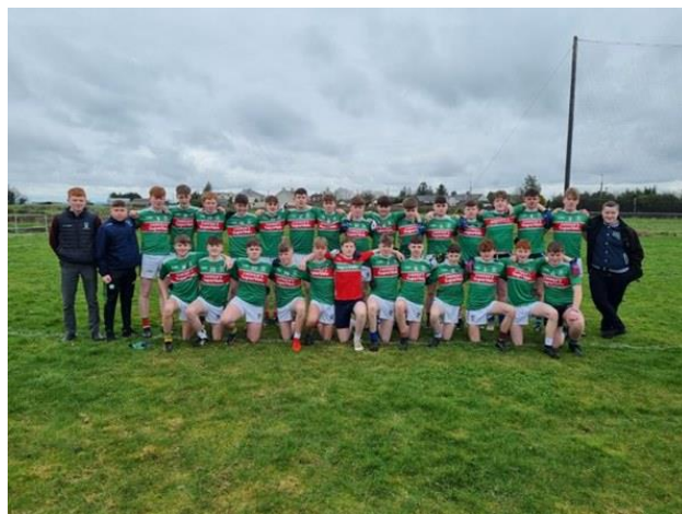
8 - U16 Boys B Panel

This team have been hugely successful over the last number of years. For this year's campaign the team and their coaches choose to promote themselves from the D division to B. This meant a significant step up in standard and quality of opposition. Even though the team lost out at the semi-final stage this championship will stand to the players as they move onto senior school's football.