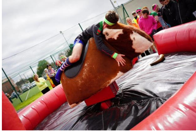
28 - Sports Day 2023