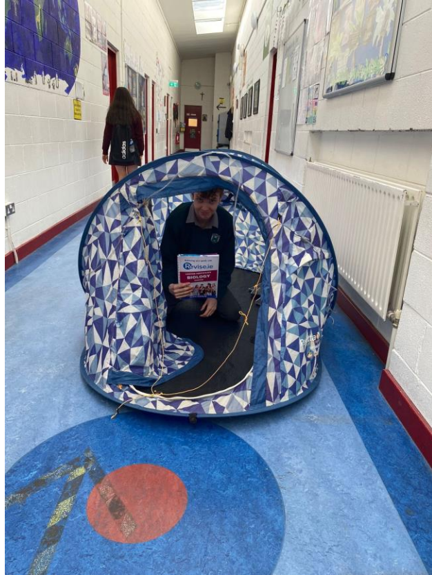
26 - "Anything but a bag"