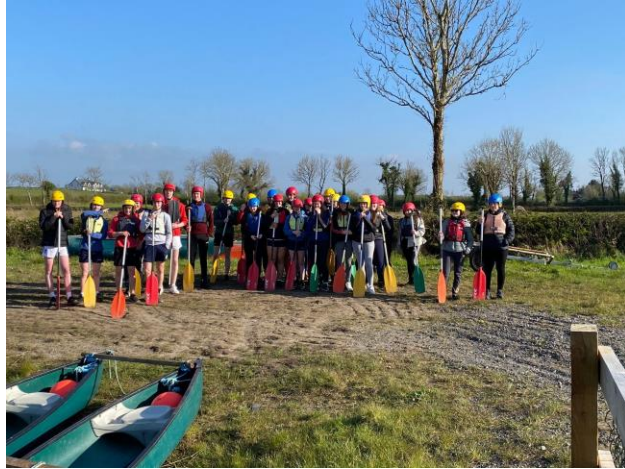
22 - TY Students on their Gaisce Trip