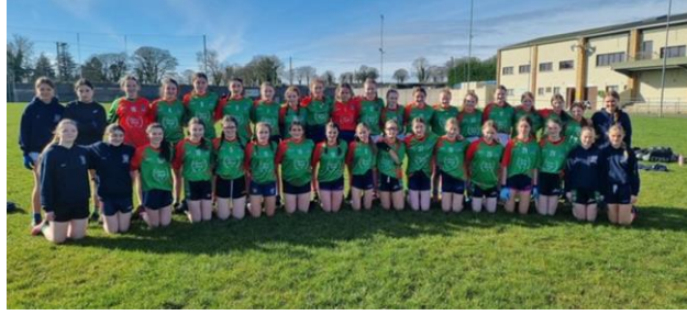
11 - U14 Girls Panel

Recap of our 2022/2023 extra-curricular activities,