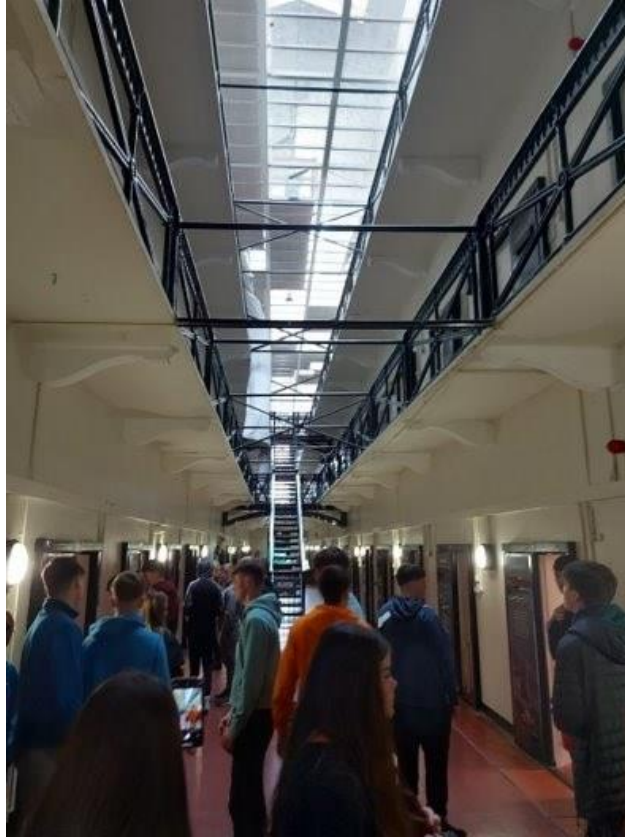
14 - Crumlin Road Gaol