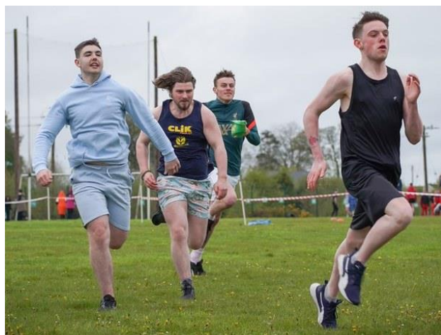
6 - LCA Students at Sports Day 2023