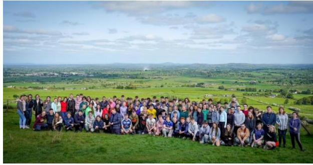
19 - 6th Year Trip to Lough Crew