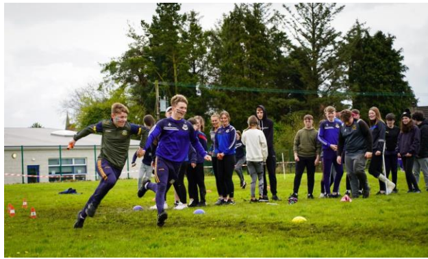
29 - Sports Day 2023