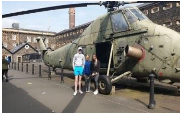
15 - Students on a tour of Belfast City