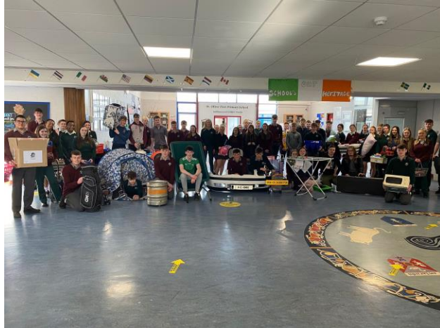
24 - "Anything but a bag"