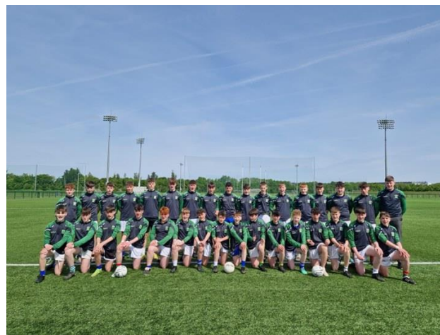
10 - 2nd Year Boys Panel

The U14 girls' team had also made great progress since the beginning of the year. They had won both of their group games and in mid-April the girls had a convincing win in their quarter final against Colaiste naMí. However, the girls met their match against a strong Moyne team in their semi-final. After a tight first half they lost out on a score line of 4-4 to 1-6.