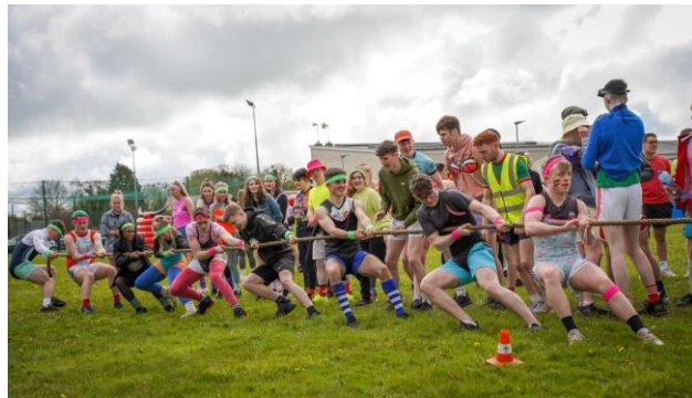
27 - Sports Day 2023