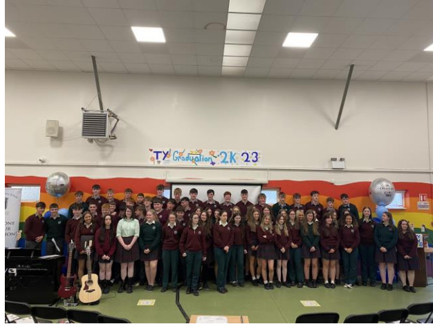
17 - TY Students 2022/2023