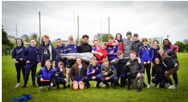
30 - Sports Day 2023