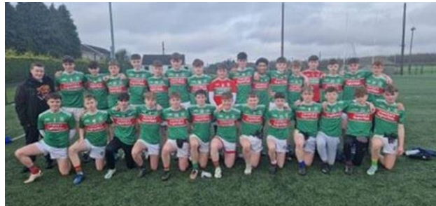
7 - U16 Boys A Panel

Following on from our Spring Newsletter the U16 boys, the 2nd year boys and the U14 girls were still competing in their relevant competitions.