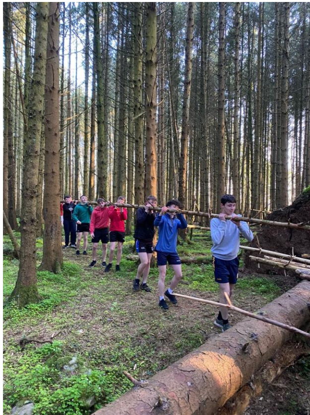
23 - TY Students on their Gaisce Trip