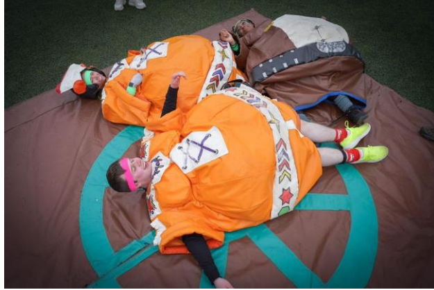
31 - Sports Day 2023