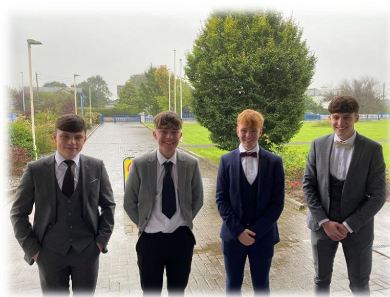
6 th Year Students taking Non-Uniform Day to a new level