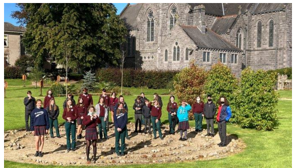
2 nd years visit the church grounds during Wellbeing week

Well done to all students and staff who participated so well in all of the events and made it such an enjoyable week. There is always somebody there to listen so we hope that by raising awareness of wellbeing that we can show students what supports there are in place and give them the tools to cope when things get tough.