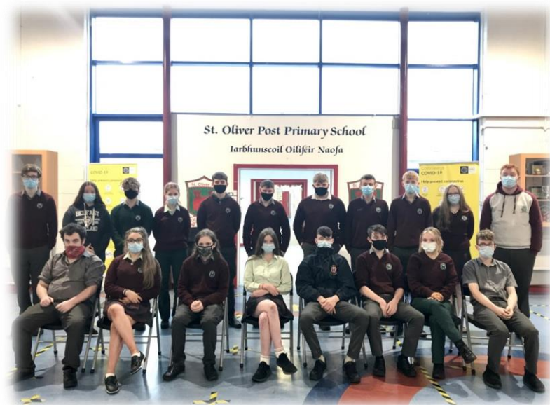
Our new LCA group