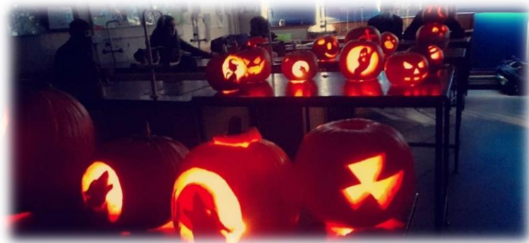
LCA Pumpkin Carving