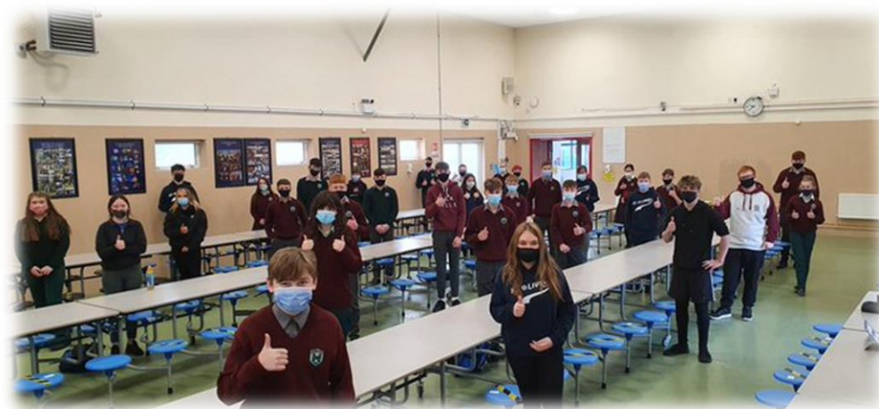
Our new Student Council Team