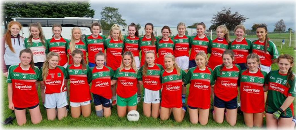
Senior Gils GAA Squad