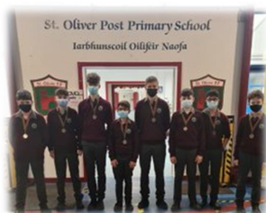
The winners of the 1 st year GAA blitz, which was organised by our LCA's