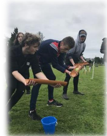
LCA Team Workshop with "Go Beyond Adventures"