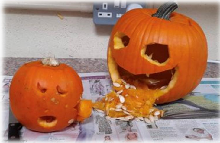
TY Students - Pumpkin Carving